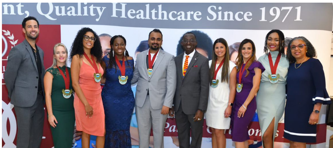
All smiles: Teaching Health Center leadership proudly stand with the 2023 graduating class