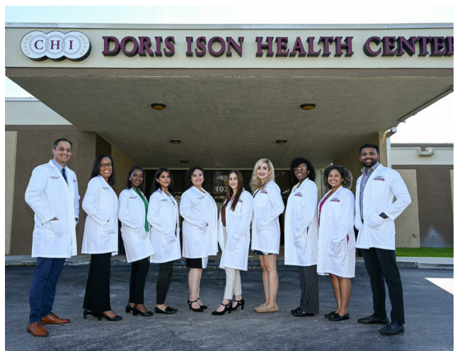
The newest resident class of the Teaching Health Center pose for their first group photo at the Doris Ison Health Center.

"As you put on this white coat today, it is important that you don't see it as a symbol of power and authority," he said. "When you put it on, we want you to remember it is a symbol of service to humanity. This white coat must represent big hearts, compassion, empathy, and professionalism."