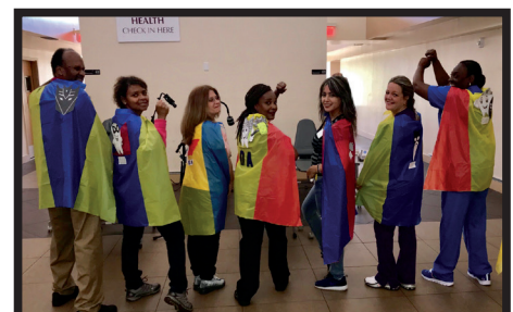
The CHI Dental Team shows off their capes as they screen children at the Back to School Health Fair.

Florida City for the families of migrant farm workers, plus a health fair at Chapman Partnership for the Homeless and it all wrapped up with School Physical Day at the majority of CHI's health centers. Hundreds of children received physicals for just $25 and free vaccinations.