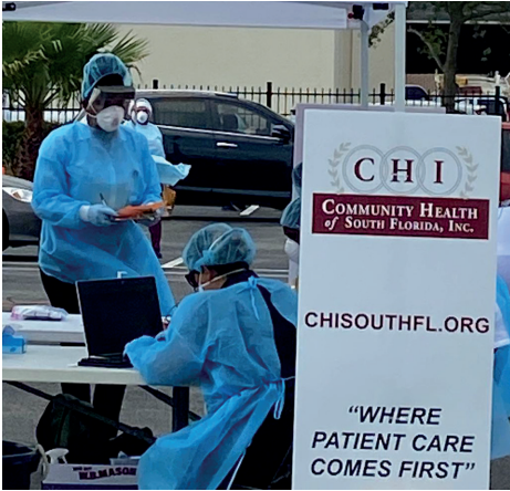
COVID19 testing conducted at The Martin Luther King Health Center

With South Florida facing a health crisis, Community Health of South Florida, Inc. became the first facility to offer drive-through COVID-19 testing in Miami-Dade and Monroe County. The non-profit organization sprung into action, mobilizing its team and providing many communities invaluable health resources when they were most needed.