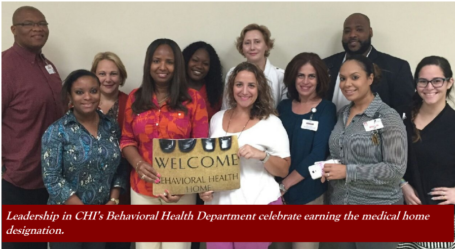
Leadership in CHI's Behavioral Health Department celebrate earning the medical home designation.