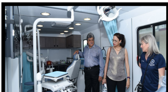
CHI's mobile dental unit allows dental providers to bring their services to the community.