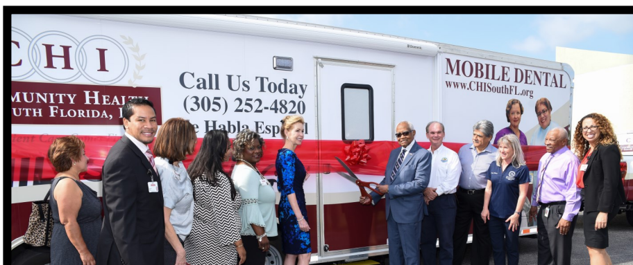
CHI & community leaders cut the ribbon on the new dental trailer.

The mobile dental unit will bring CHI's dental teams into neighborhoods and schools throughout South Florida. It is already in operation in communities where dental services are greatly needed.