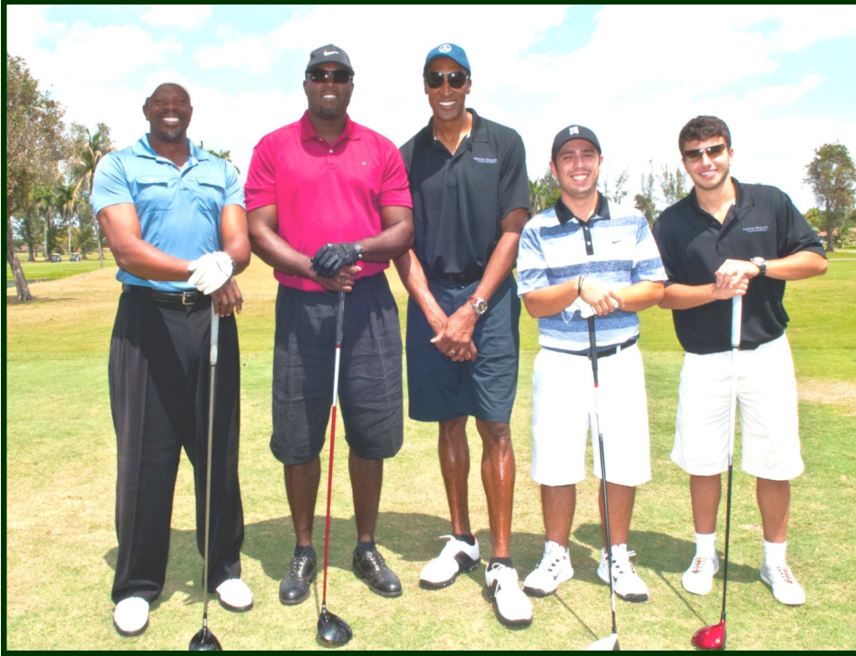
Glen Rice, Scottie Pippen and other Golfers attend the Annual Golf Tournament benefiting CHI.

When celebrities, like former NBA All Star Glen Rice, hit the links on April 1, 2016, they will be swinging with a greater good in mind. The annual Glen Rice Celebrity Golf Tournament raises funds for a variety of programs at Community Health of South Florida, Inc. (CHI).