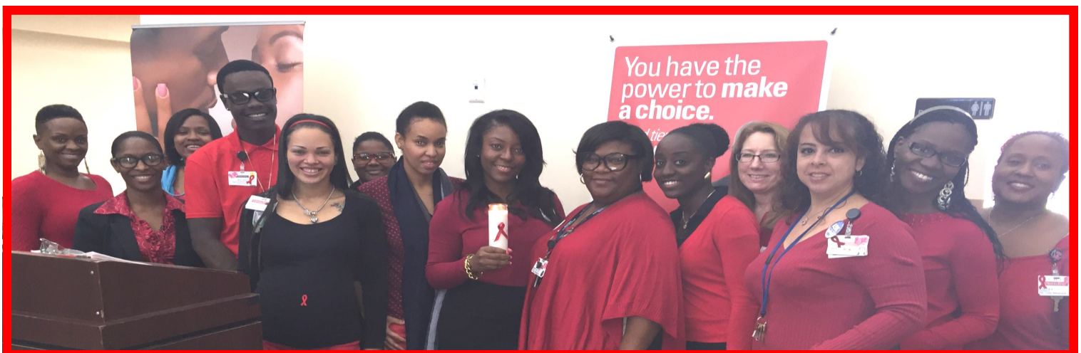
CHI C.A.R.E.S. team lights a candle to commemorate the 2015 World AIDS Day.