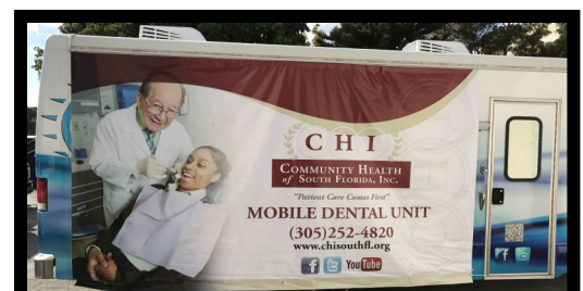
CHI’s mobile dental unit allows dental providers to bring their services to the community.

To make a dental appointment call (305) 252-4820.