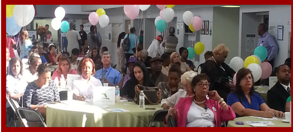
Audience members listen to valuable information from a number of speakers at CHI's launch event for the Affordable Care Act.