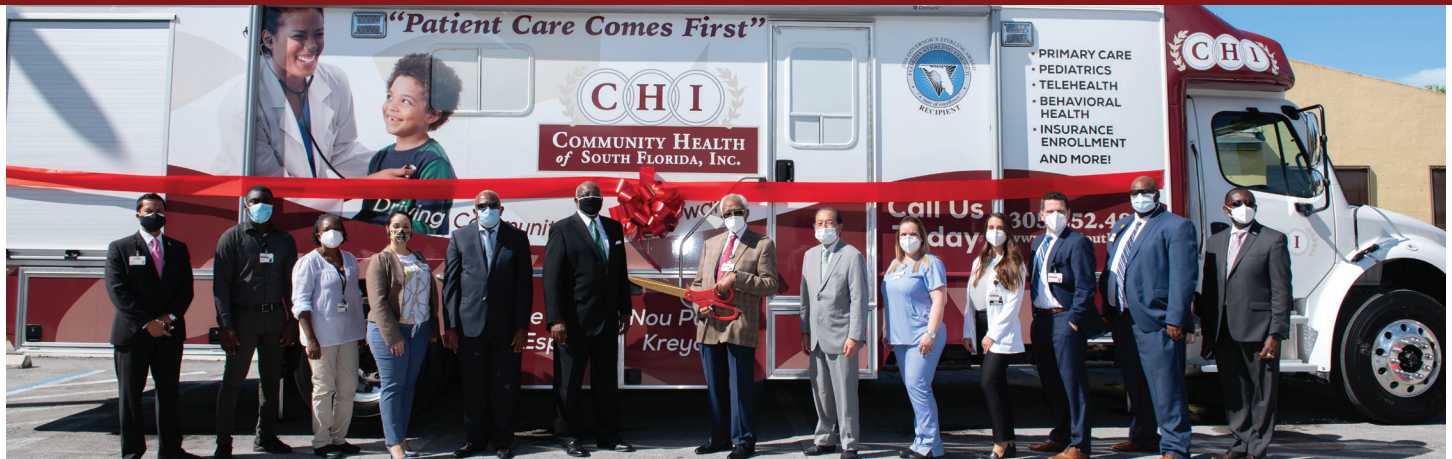
CHI leaders celebrate the ribbon-cutting ceremony of the new state-of-the-art mobile medical van.

Healthy Bits – A Newsletter Published by Community Health of South Florida, Inc.