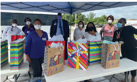
CHI team members prepare gifts for therapeutic foster care parents via a drive-through format.

The 26 families serving as foster parents in Community Health of South Florida, Inc.'s Specialized Therapeutic Foster Care Program are facing tough times. The challenge of caring