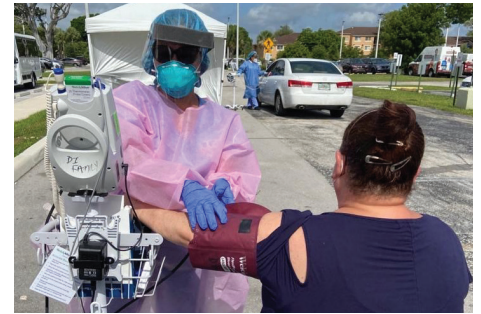
The nurse monitors a patient's blood pressure at CHI's Diabetes Drive-Through Screening.

"Our physical layout is ideal to follow the necessary precautions during this