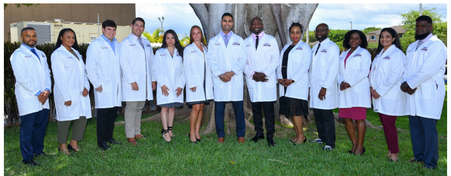
Class of new residents stands together after their white coat ceremony at the Doris Ison Health Center.

On June 19, 2022, CHI welcomed 12 incoming medical residents with an intimate white coat