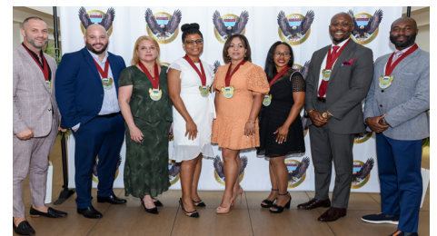
Teaching Health Center graduates for the class of 2022.