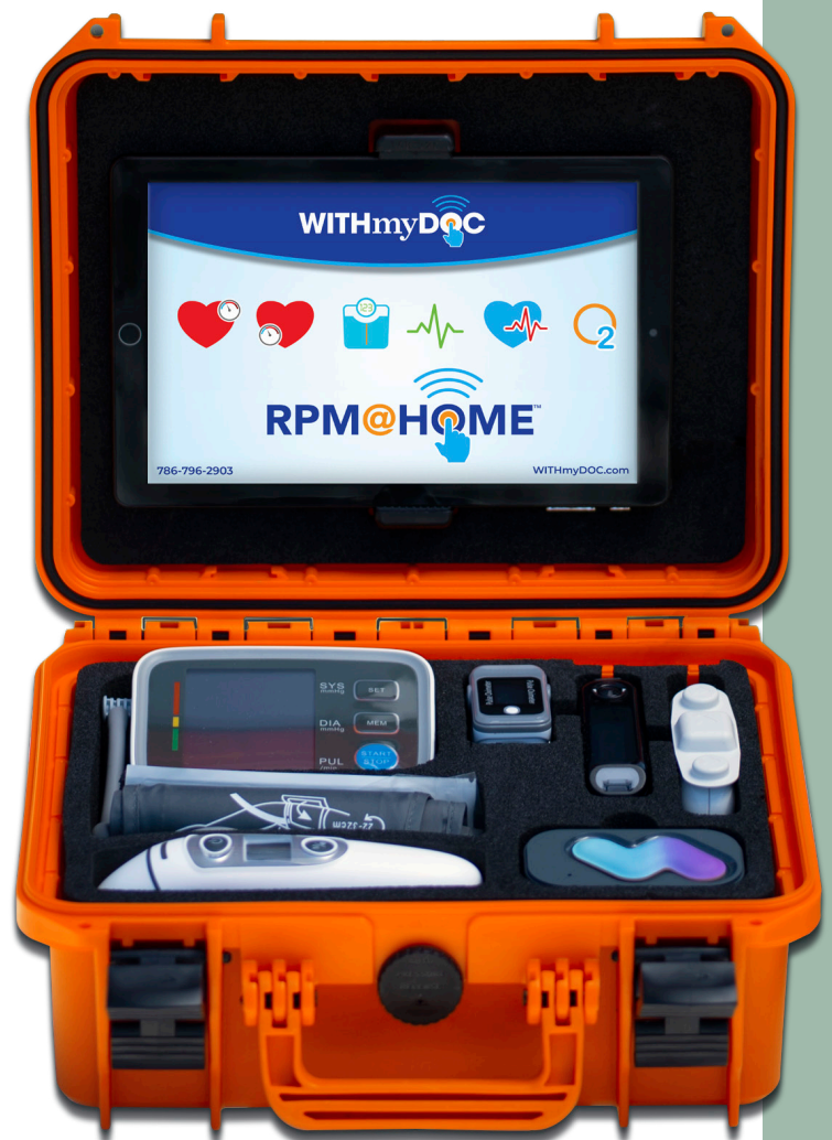
CHI will give patients devices to take home and assist with monitoring their health.

The remote patient monitoring service will be offered in English, Spanish and Haitian Creole this summer and eligible patients will be invited to enroll.