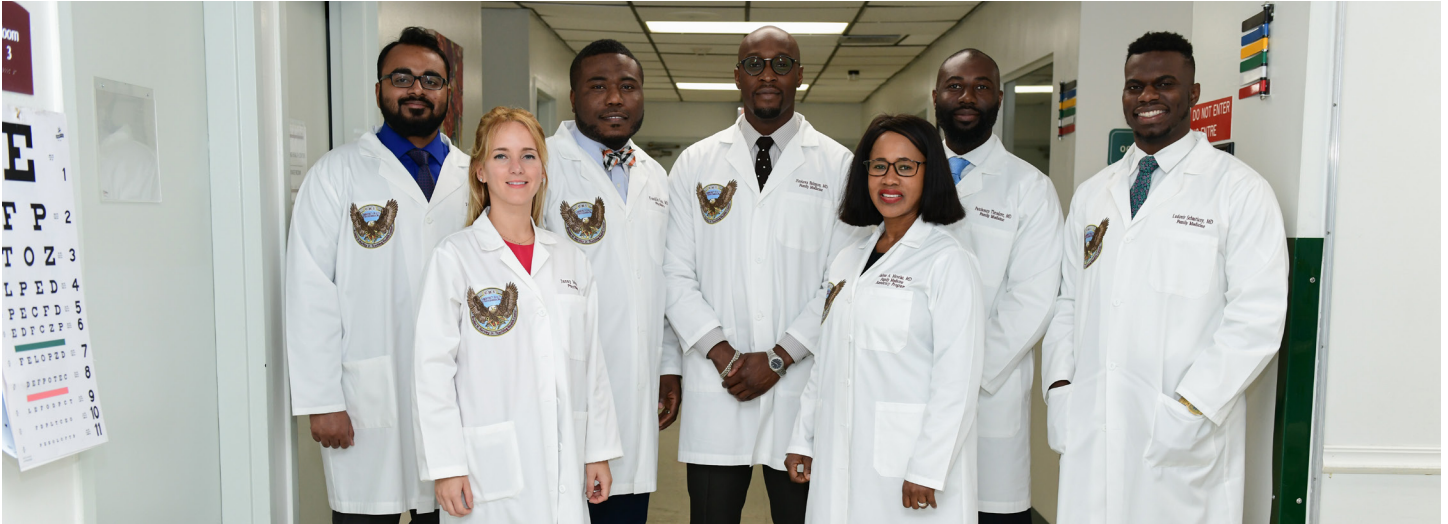
CHI's newest class of medical residents contribute to the overall quality of healthcare within the organization.

Community Health of South Florida, Inc. (CHI) is recognized by the U.S. Department of Health and Human Services (HRSA) as a “Health Center Quality Leader.” CHI received the award for placing among the top 20 percent nationwide in clinical quality measures.