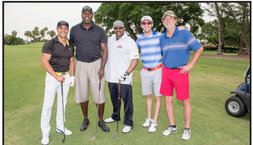
Glen Rice and friends enjoyed their day on the golf course at the CHI Celebrity Golf Tournament.