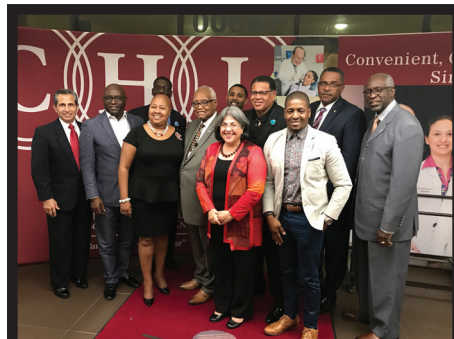
CHI leadership, political leaders and religious leaders join together for a photo after the religious leaders recognition dinner.