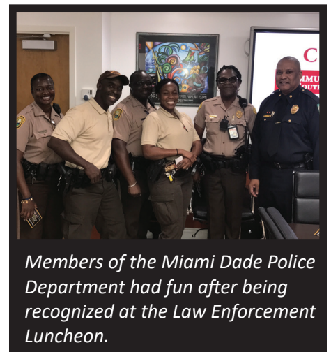
Members of the Miami Dade Police Department had fun after being recognized at the Law Enforcement Luncheon.