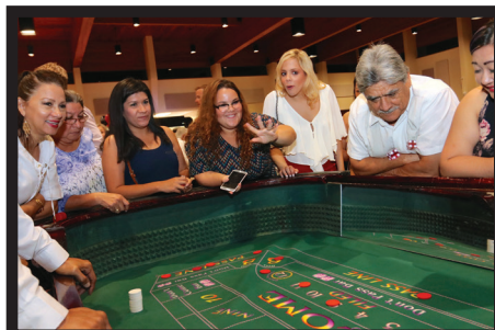
CHI Board members and community members have fun playing a game during Casino Night.

was Casino Night hosted by Community Health of South Florida, Inc.'s Foundation. The fundraiser brought in almost $30,000 to help CHI build a children's crisis center.