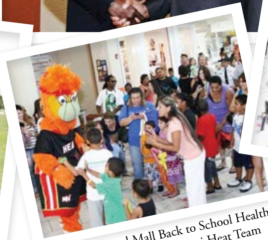
Annual Southland Mall Back to School Health Fair: Community Partner Miami Hear Team Mascot Burnie and children