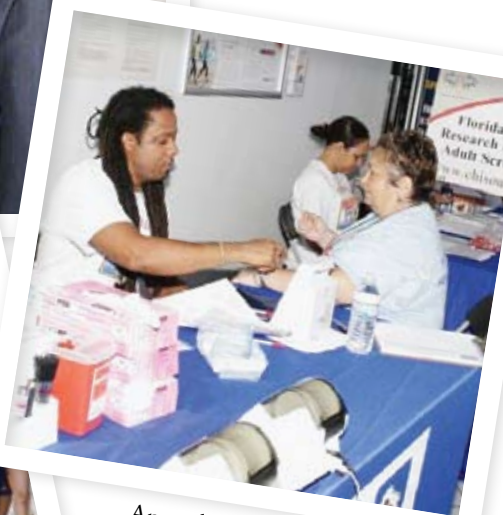
Annual Henry Schein's Healthy Lifestyles, Healthy Communities Health Fair: Adult screening